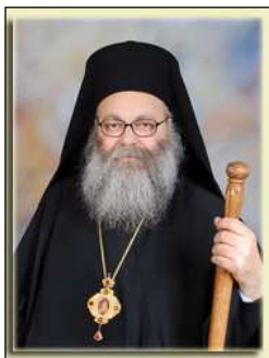
The Biography of His Beatitude Patriarch JOHN X Greek Orthodox Patriarch of Antioch and all the East