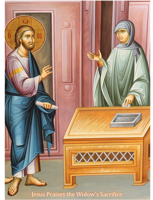
Jesus Praises the Widow's Sacrifice

While in the online database, you can join any of the above groups. Please assign yourself and any family member to as many groups as you desire.